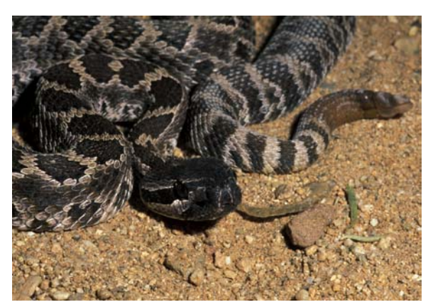
Western Rattlesnake (Crotalus viridis).

Most encounters involve the Red Diamond ( Crotalus ruber ) and Western Rattlesnakes ( C. viridis ). Both are large-bodied, terrestrial snakes that prefer the same habitat prized by housing developers. As a result, homes are built in areas already occupied by these snakes. During times of construction, the snake populations are either destroyed by bulldozers and earthmovers or pushed into the adjacent wild lands. Once the construction stops, families living along the margins of the development often have the highest occurrence of snake encounters.