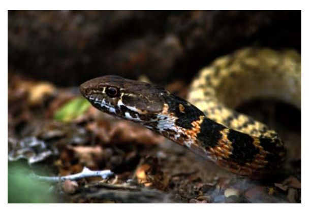
Baja California Coachwhip (Masticophis f. fuliginosus)