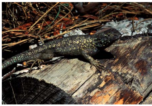
Western Fence Lizard ( Sceloporus occidentalis ) perched on log showing camouflaged color pattern.