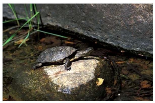
Pacific Pond Turtle ( Clemmys marmorata ) from Boulder Creek, San Diego County.

In San Diego County, there are records of four species of seaturtles, of which, only the Green Seaturtle is a resident. The Desert Tortoise has been reported from the extreme northeast corner of the county in Anza Borrego Desert, although it is now likely extinct. And, of the many freshwater turtles