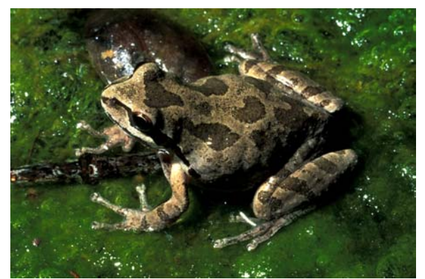
Pacific Treefrog (Pseudacris regilla)

Frogs can be noisy animals. Males will call to attract females and to signal rival males about territorial boundaries. Calling is also used to establish social status. Calls consist of simple rib-its to lengthly trills . During the springtime breeding season, females will choose a suitable male and enter his territory. The male will mount the female, grasping her behind the forelimbs in a behavior called amplexus . When the female lays her eggs, the male will fertilize them externally. Eggs hatch into tadpoles (frog larvae) and transform through metamorphosis into tail-less adults.