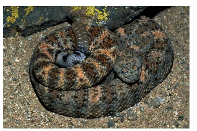
Speckled Rattlesnake (Crotalus mitchellii)