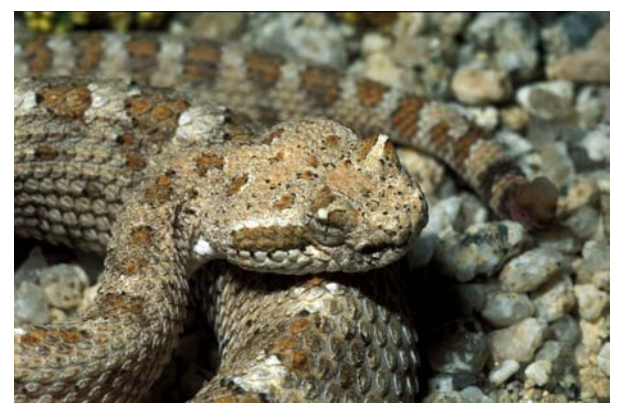
Sidewinder (Crotalus cerastes).

Most San Diegans simply want help identifying which species of snake was seen crawling through their woodpile. Others are more concerned. San Diego County is home to 25 different species of snakes. Four of these are rattlesnakes. Two species of rattlesnakes are not commonly seen by San Diegans. The Sidewinder ( Crotalus cerastes ) is restricted to our deserts and the Speckled Rattlesnake ( C. mitchellii ) is more secretive, preferring rocky terrain.