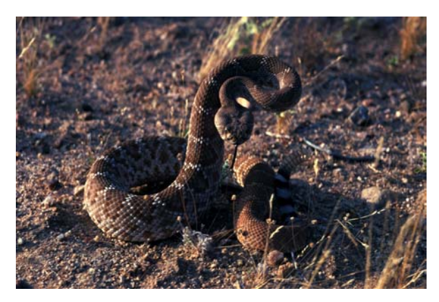
Red Diamond Rattlesnake (Crotalus ruber).