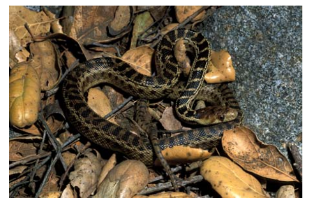
Gophersnake (Pituophis catenifer)

There are no sexual differences in color pattern between males and females in snakes, likely because snakes are color blind. Snakes communicate mainly through smell, but rattlesnakes have highly ritualized combat and courtship behaviors. Reproduction is similar to that describe for lizards with the use of the hemipenis that everts from the cloacal vent. Gartersnakes, boas, and rattlesnakes retain their eggs and give birth to live, fully-formed babies. Other snakes lay eggs in burrows and leave them to hatch on their own.