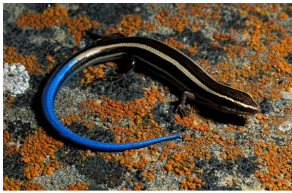
A juvenile Western Skink ( Eumeces skiltonianus ) with a bright blue tail.

Lizards have a generalized body plan with four legs and a tail. In San Diego County, lizards represent the most diverse reptile group. There are a variety of species including iguanas, geckos, skinks, legless lizards, and whiptails. Lizards have a scaly integument and a number of survival strategies. Most lizards have the ability to detach their tail to misdirect a predator's interest. Many use caudal luring to attract predators to the tail. Tails are either brightly colored or waved above the body in an undulating motion. If the tail is lost during an attack, it will eventually regrow.