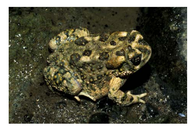
Arroyo Toad (Bufo californicus)