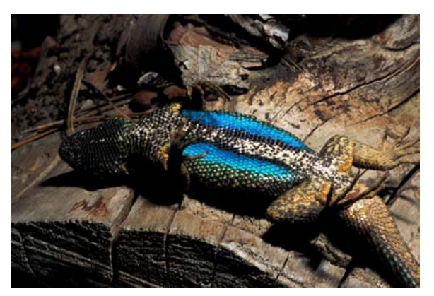
Western Fence Lizard ( Sceloporus occidentalis ) showing display colors below.

Lizards in San Diego County all reproduce by laying eggs. Internal fertilization is achieved with the use of one of the two hemipenes that evert from the cloacal vent.