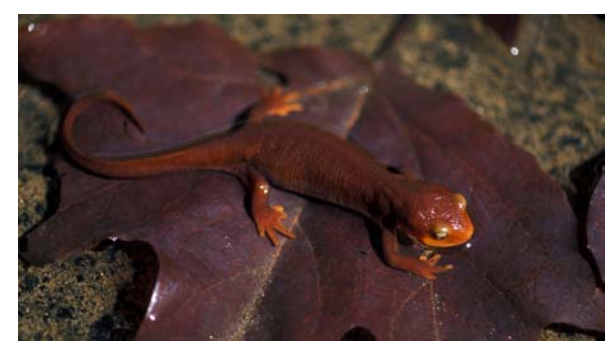
California Newt ( Taricha torosa ) from Boulder Creek, San Diego County.

The generalized body-form of salamanders gives them a lizard-like appearance. In San Diego County, there are two families with remarkably different ways of life. The California Newt has a generalized amphibian life history. They lay eggs underwater, aquatic larval hatch, and metamorphosis transforms the larvae into terrestrial adults. The California Newt relies on standing bodies of water to reproduce and are known to return to pools from which they were hatched. These newts are also extremely toxic which makes them less susceptible to predation. The Lungless Salamanders have a different strategy. These